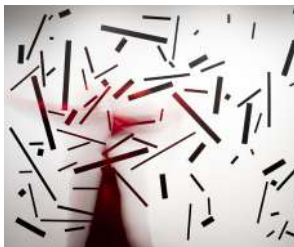
21 "Embodiment in the Space Between Us No. 25, Red" from the "Embodiment" series Archival print, 1/10 framed without glass 36h x 48w 2020 $3200