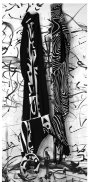
20 "Towers of Power, worn 2011–2014" from the Beloved series* Archival print Artist proof, 42h x 20w 2022 $1200