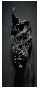
17 "Shed 6" from the Exuvia series Fuji print on backside of clear acrylic with aluminum mounting fixture 47h x 20w x 1.25 2017 $2800