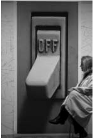
02 "Que'est-ce que c'est?" from the On/Off series* Archival print, framed 20h x 16w 2020 $600