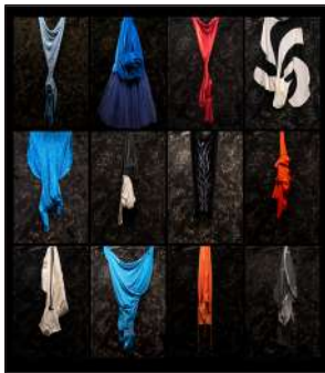
19 "Beloved— Grid of 12 Dresses" from the Beloved series* Archival print Artist proof, 40h x 37w 2022 $1800