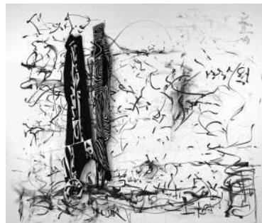
26 "Towers of Power on Markings 11" from the Beloved series* Installation of Towers of Power dresses, worn 2011–2014, attached to Markings 11 painting on canvas, 86h x 104w (2021) $9500