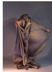
25 "Nude in Blue and Gold, moving" from the Through the Veil series* Archival print, framed 17h x 11w 2011