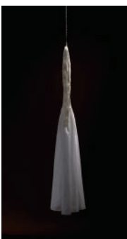
14 "Relic 6: "My dress was boring, but I love what came out of it." from Relics of Marriage Archival print, framed 36h x 22w 2015