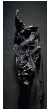
17 "Shed 6" from the Exuvia series Fuji print on backside of clear acrylic with aluminum mounting fixture 47h x 20w x 1.25 2017