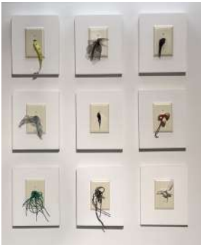
03 "On/Off Alternatives" from the On/Off series* 10h x 8w assemblages with switch plates on wood panels 2022 Top row, Left to Right: #3, #2, #4 Middle row, Left to Right: #6, #9, #5 Bottom row, Left to Right: #7, #1, #4