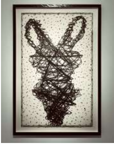
11 "Body Armor 12" from the Body Armor: Bathing Suit series* Mixed media on Arches fine art paper, framed 41h x 26w 1997