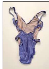
10 "Body Armor Inspiration" Photograph of the original 1980s swimsuit for the Body Armor: Bathing Suit series* Archival print, framed 27h x 20w 2022