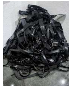
16 "PIT" from the Belted series Small installation of black belts 2022