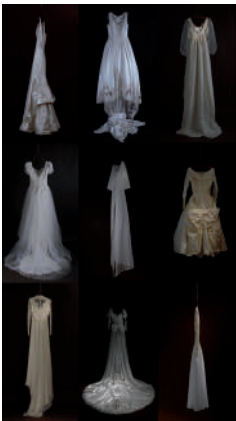
13 "Relics of Marriage, Left Panel of Triptych" from Relics of Marriage Archival print, framed 58h x 36w 2015