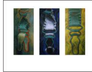
06 "Garter Belts, triptych" The beginning of the Art of Personal Mythology in 1984 (Original 5 ft. tall paintings—collection of Terry Fox) Archival print, unframed 16h x 20w 2022