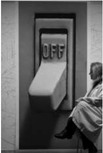
02 "Que'est-ce que c'est?" from the On/Off series* Archival print, framed 20h x 16w 2020