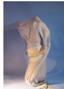
24 "Nude in Silver, moving" from the Through the Veil series* Archival print, framed 17h x 11w 2011