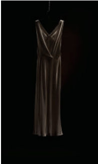
12 "Relic 27: "Our secret marriage began in New Orleans, two years before Hurricane Katrina." from Relics of Marriage Archival print, framed 36h x 22w 2015