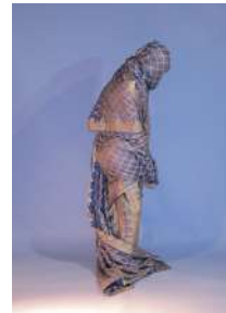
23 "Nude in Blue and Gold, shrouded" from the Through the Veil series* Archival print, framed 17h x 11w 2011