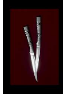
07 "SLIT Duo" from the SLIT Series* Archival print, on Dibond with mounting fixture 46h x 30w 2022