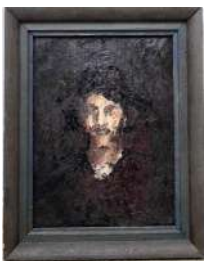
05 "Ancestor" My first oil painting* 1963