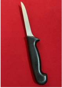
01 "SLIT One" from the SLIT series* Archival print Artist Proof, 57h x 40w 2022