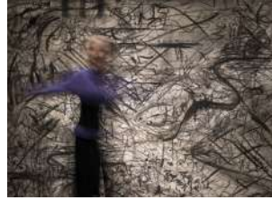
22 "Chaos in Embodiment" from the "Embodiment" series Archival print on board, Cleat mounted, 26h x 36w 2000