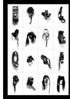
15 "Belted Grid of 16" from the Belted series Archival print, framed 39.25h x 27.5w 2022