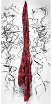
18 "A Suitable Dress, worn in the 2000s" from the Body Armor: Dresses series* Archival print Artist proof, 42h x 20w 2022