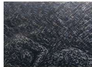
09 "Frenzy" from "all of us alone" Mixed media on Arches fine art paper, framed 30h x 44w 2003