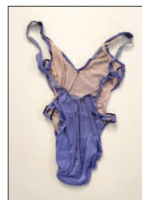
10 "Body Armor Inspiration" Photograph of the original 1980s swimsuit for the Body Armor: Bathing Suit series* Archival print, framed 27h x 20w 2022