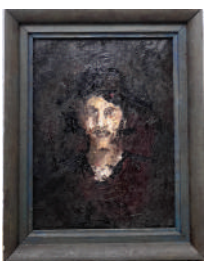
05 "Ancestor" My first oil painting* 1963