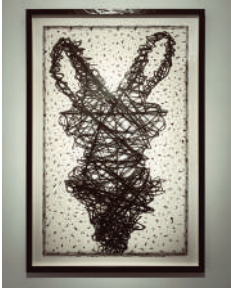
11 "Body Armor 12" from the Body Armor: Bathing Suit series* Mixed media on Arches fine art paper, framed 41h x 26w 1997