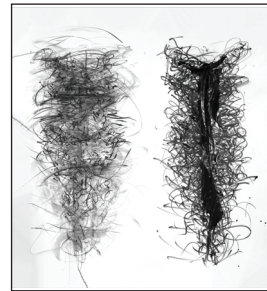
08 "Exposed 3&4" from the Exposed series Archival print scanned from the 2017 72" x 72" drawing. 23.5w x 23.5w, framed 2022