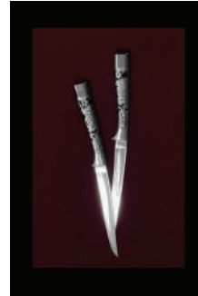
07 "SLIT Duo" from the SLIT Series* Archival print, on Dibond with mounting fixture 46h x 30w 2022