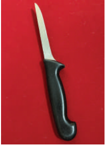
01 "SLIT One" from the SLIT series* Archival print Artist Proof, 57h x 40w 2022