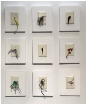
03 "On/Off Alternatives" from the On/Off series* 10h x 8w assemblages with switch plates on wood panels 2022 Top row, Left to Right: #3, #2, #4 Middle row, Left to Right: #6, #9, #5 Bottom row, Left to Right: #7, #1, #4