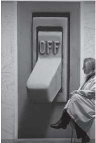
02 "Que'est-ce que c'est?" from the On/Off series* Archival print, framed 20h x 16w 2020