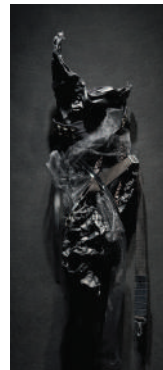
17 "Shed 6" from the Exuvia series Fuji print on backside of clear acrylic with aluminum mounting fixture 47h x 20w x 1.25 2017