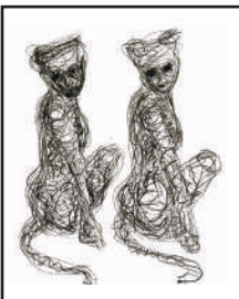
04 "The Twins" from the Panther series, based on the poem "The Panther" by Rainer Maria Rilke Archival print scanned from 1998 drawing, framed, 2021