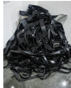
16 "PIT" from the Belted series Small installation of black belts 2022